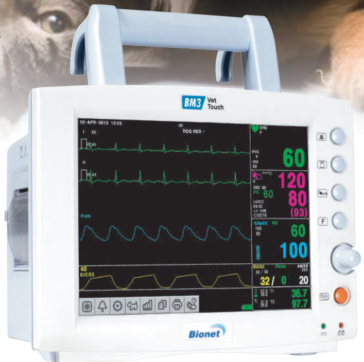
Trend Display Mode